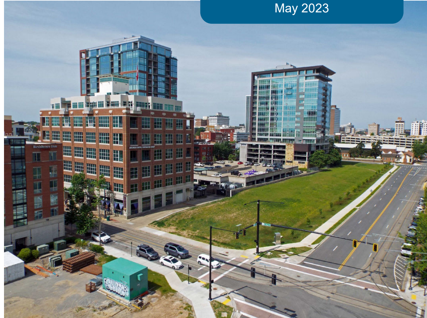
Ramp Demo to Cumberland St May 2023