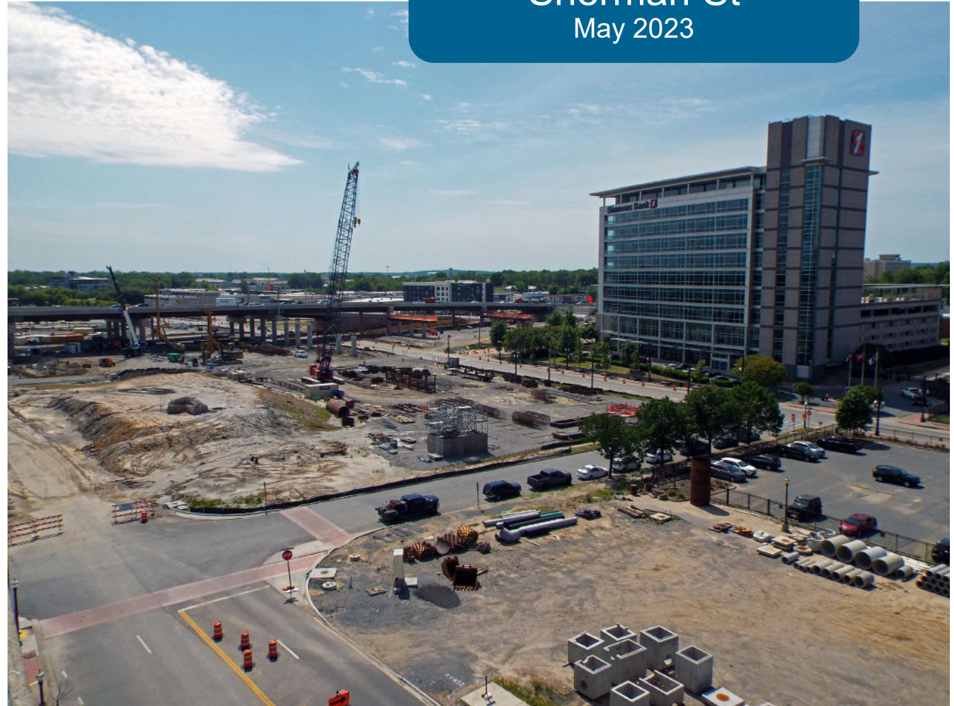
Ramp Demo over Sherman St May 2023