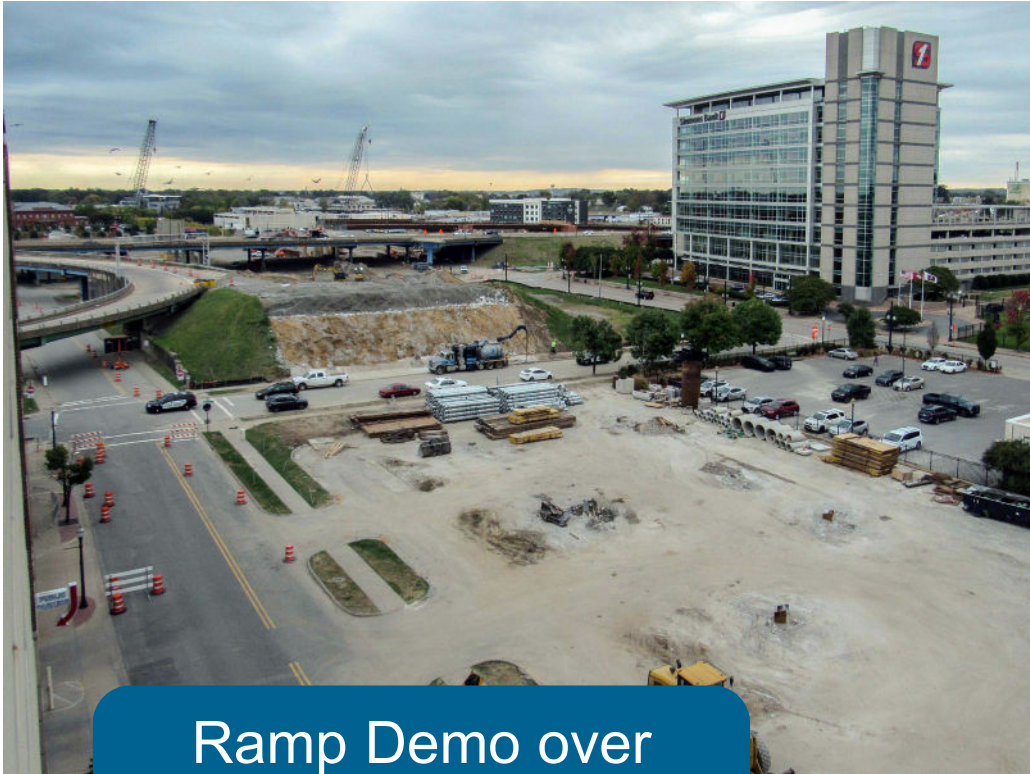
Ramp Demo over Sherman St October 2021