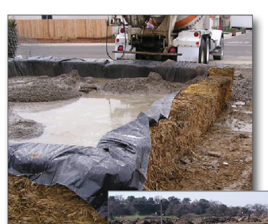
Figure 9. Hay bale and plastic washout pit

A washout pit made with hay bales and a plastic lining is shown in Figure 9. Such pits can be dug into the ground or built above grade. The plastic lining should be free of tears or holes that would allow the washwater to escape (Fig. 10). After the pit is used to wash down the chutes of multiple ready mixed trucks and the washwater has evaporated or has been vacuumed off, the remaining hardened solids can be broken up and removed from the pit. This process may damage the hay bales and plastic lining. If damage occurs, the pit will need to be repaired and relined with new plastic. When the hardened solids are removed, they may be bound up with the plastic lining and have to be sent to a landfill, rather than recycled. Recyclers usually accept only unmixed material. If the pit is going to be emptied and repaired more than a few times, the hay bales and plastic will be generating additional solid waste. Ready mixed concrete