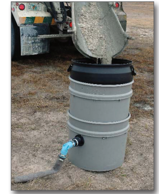
Figure 3. Concrete washout filter

Washwater from concrete truck chutes, hand mixers, or other equipment can be passed through a system of weirs or filters to remove solids and then be reused to wash down more chutes and equipment at the construction site or as an ingredient for making additional concrete. A three chamber washout filter is shown in Figure 3. The first stage collects the coarse aggregate. The middle stage filters out the small grit and sand. The third stage has an array of tablets that filter