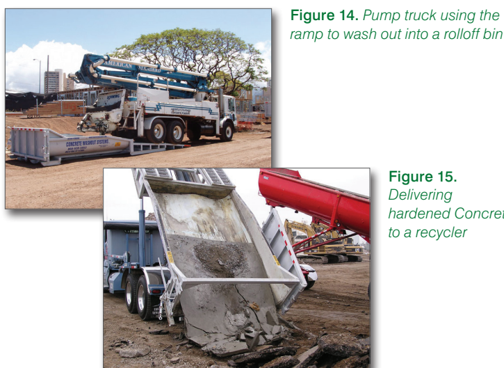
Figure 15. Delivering hardened Concrete to a recycler

then being discharged to surface water. Everything is recycled or treated sufficiently to be returned to a natural surface water.