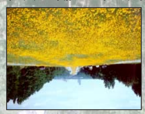
Mowing on Interstate Highways is timed to promote early summer wildflowers.

In 1998, AHTD met with representatives of Keep Arkansas Beautiful, the Arkansas Native Plant Society, the Cooperative Extension Service, and the Arkansas Federation of Garden Clubs to develop toadside maintenance schedules that provide opportunities for the preservation and enhancement of wildflower populations and satisfy motorists' safety of wildflower populations and satisfy motorists' safety of wildflower populations and satisfy motorists' safety soncerns.