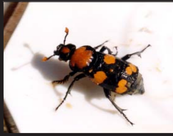
The American burying beetle is one of the endangered species identified and relocated during projects.