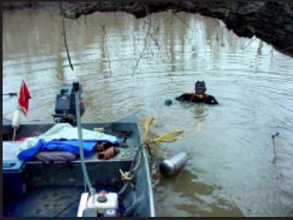
AHTD biologist dives to survey for endangered mussels.