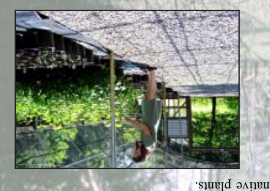
The greenhouse at AHTD's plant nursery.

AHTD Nursery is an innovative approach towards compliance with regulatory mitigation requirements incurred by the Department. The nursery enables the Department to rescue, propagate, and return to the environment wetland and other sensitive