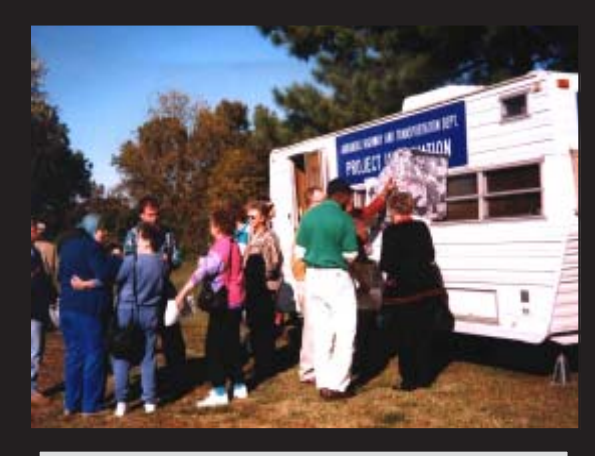
The Public Involvement trailer is used when a building is not available.