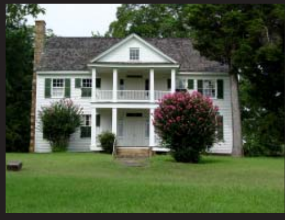
Impacts to historic structures are avoided whenever possible.