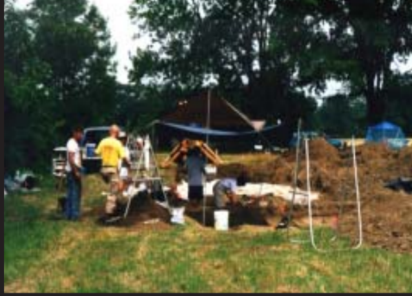
Archeological excavations of a Native American site.