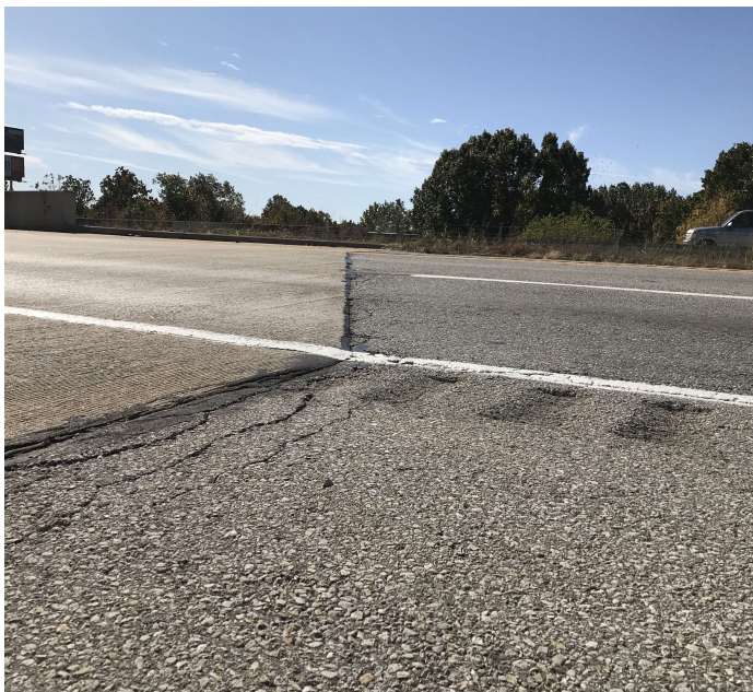
PHOTO 3 Description North approach slab and roadway are showing signs of settlement.