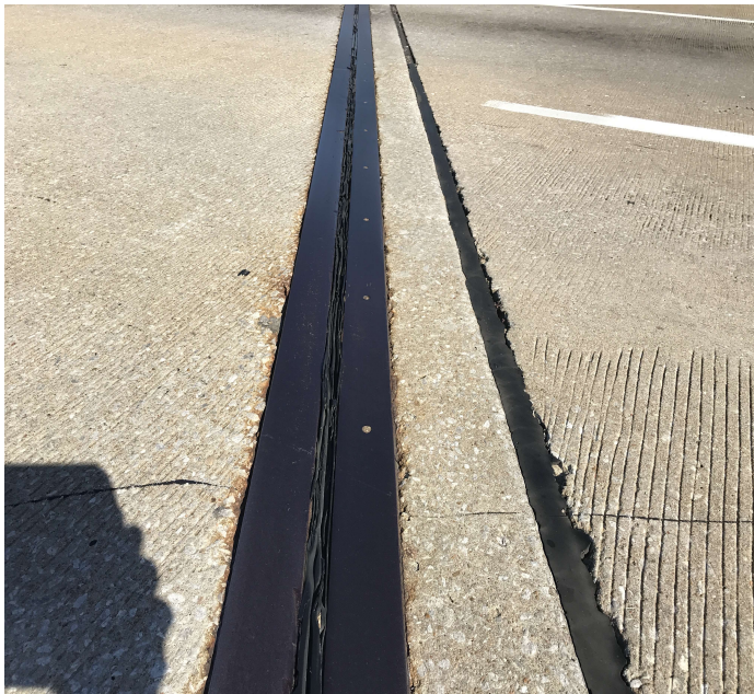
PHOTO 1 Description Abutment #1 compression joint seal typical cracking and tearing from vehicle impaction.