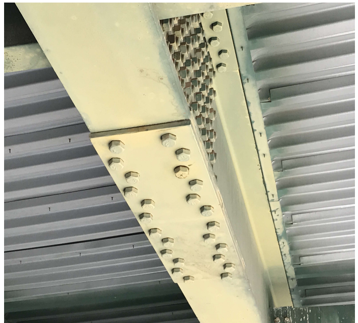
PHOTO 2 Description Span #3, girder #2 has a loose bolt in the bottom flange splice plate connection.