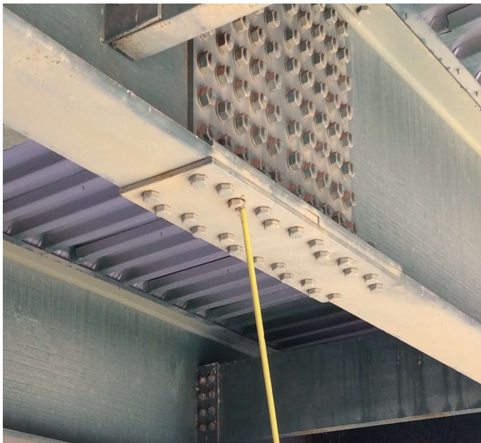
PHOTO 1 Description Span 3 Girder 2 splice plate - loose bolt.