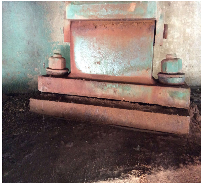
PHOTO 2 Description Abutment #1-Bearing #4-Rust staining indicating wear from fretting.