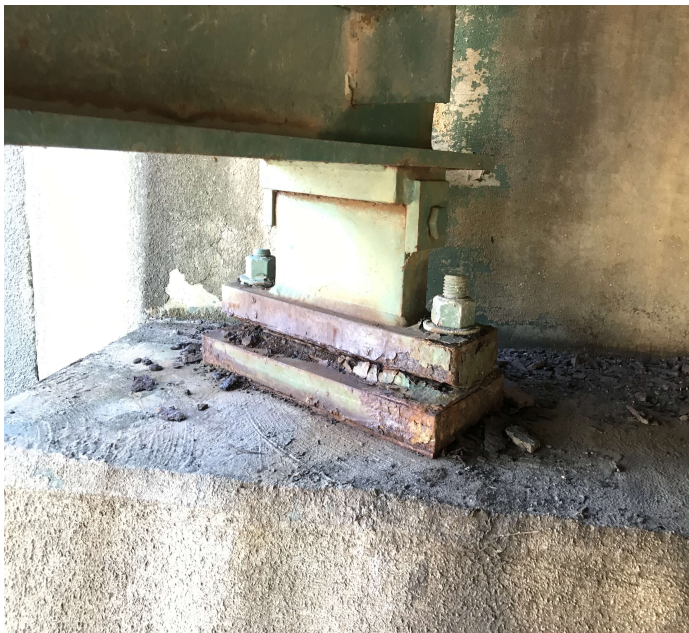
PHOTO 1 Description Abutment #1 bearing #6 pack rust in rocker area worst case at abutment #1