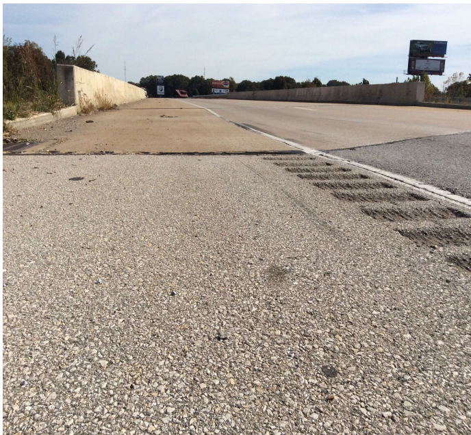
PHOTO 1 Description North approach slab-Settlement.