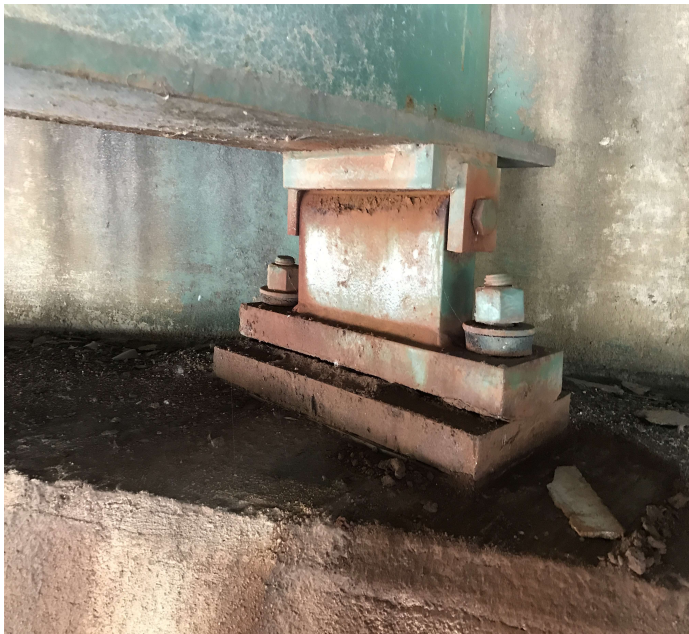
PHOTO 1 Description Abutment #1 bearing #4 rocker portion of bearings does not make contact with sole plate girder is floating over rocker bearing.