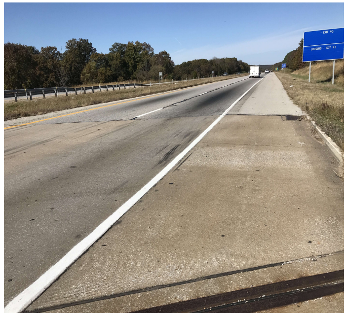
PHOTO 2 Description North approach slab and roadway are showing signs of settlement.