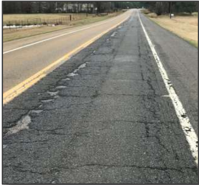
Little River County Highway 32 Between Foreman and Ashdown