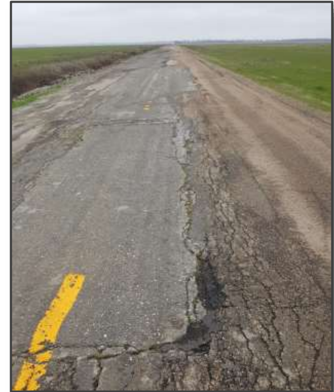
Miller County Highway 134 5 Miles East of Fouke