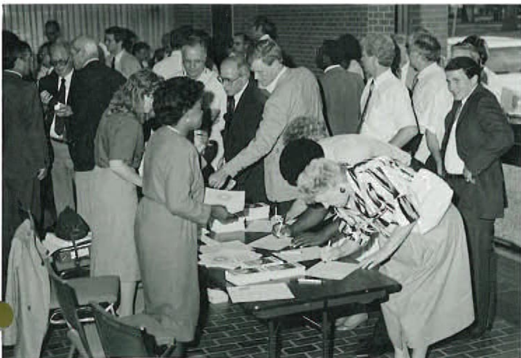
Registration at the Monticello meeting conducted in early August.

The highway program as it was presented at the public meetings was developed last year by the Highway Commission at the request of Arkansas business and industrial leaders. The program identifies the major highway corridors in the state and proposes to widen those routes to four-lanes.