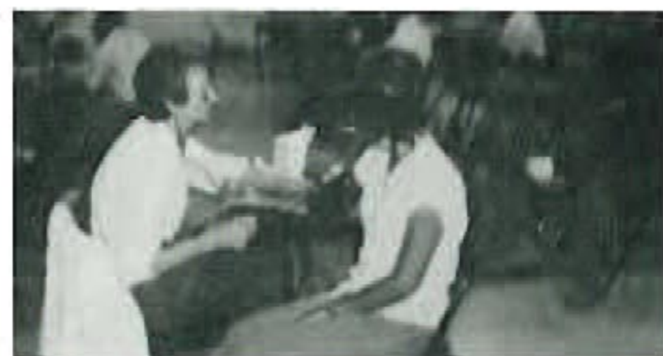
Being Checked Out