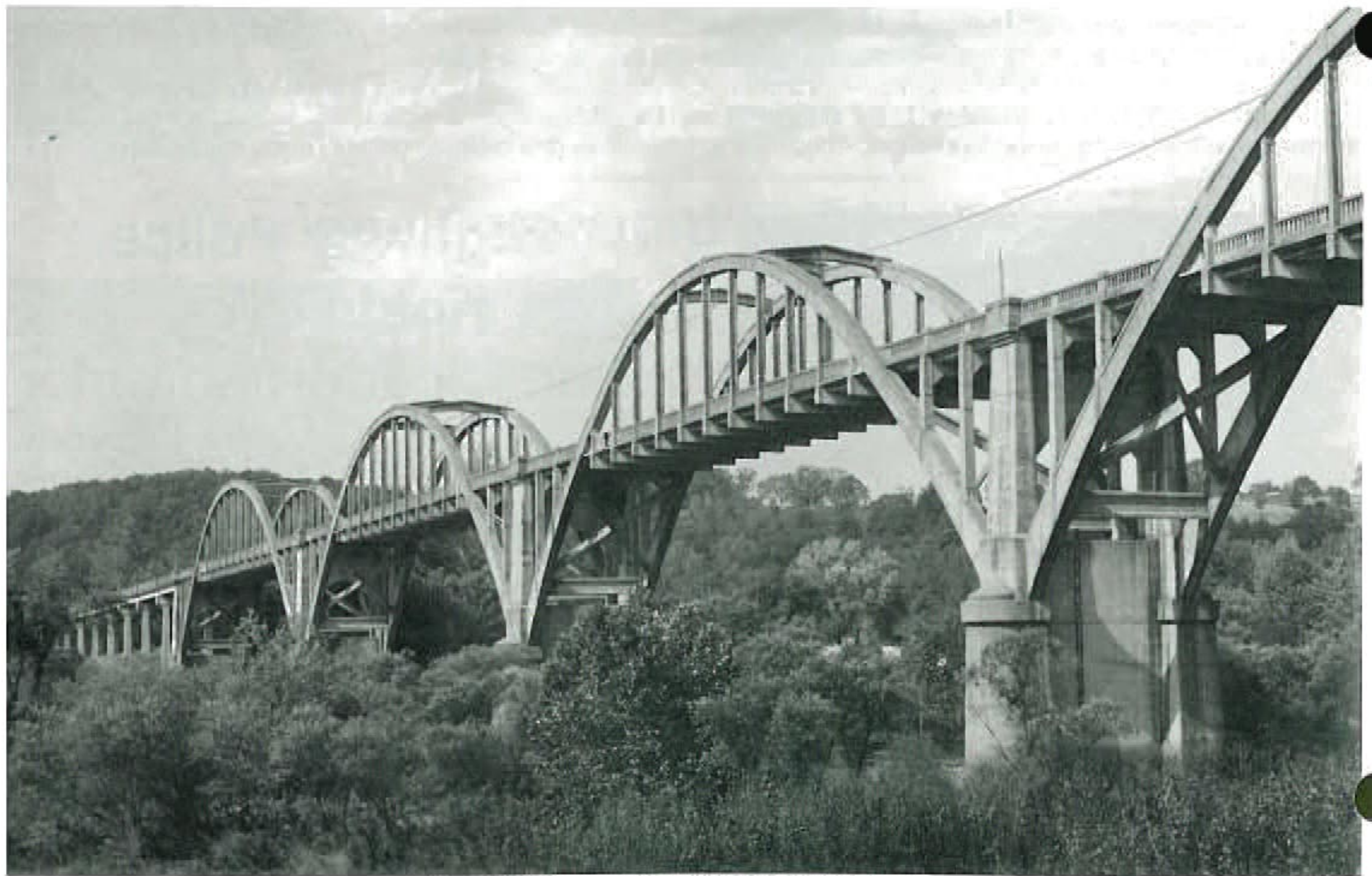
Highay 62 bridge crossing the White River in Cotter.

It seems that the Highway Commission in the mid-1920's authorized feasibility studies for nine proposed new bridges, one of which was the bridge at Cotter. All of the studies were favorable except for the one for the Cotter bridge. Judge Ruthven noticed this before the Highway