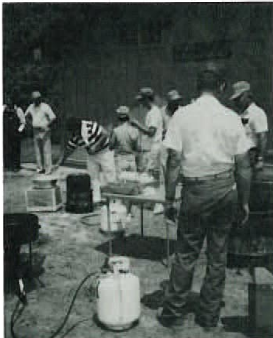
The Chefs at work

The District One Chapter of the AHTD Retirees Association held their annual fish fry at Village Creek Park on June 2. Approximately 75 retirees and their guests enjoyed fish and fellowship and the reports we received indicated everyone is looking forward to the next one.