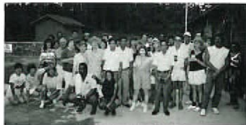
Human Resources Picnic

and certificate and acknowledged her dedication to the Department and her pleasant attitude to her co-workers.