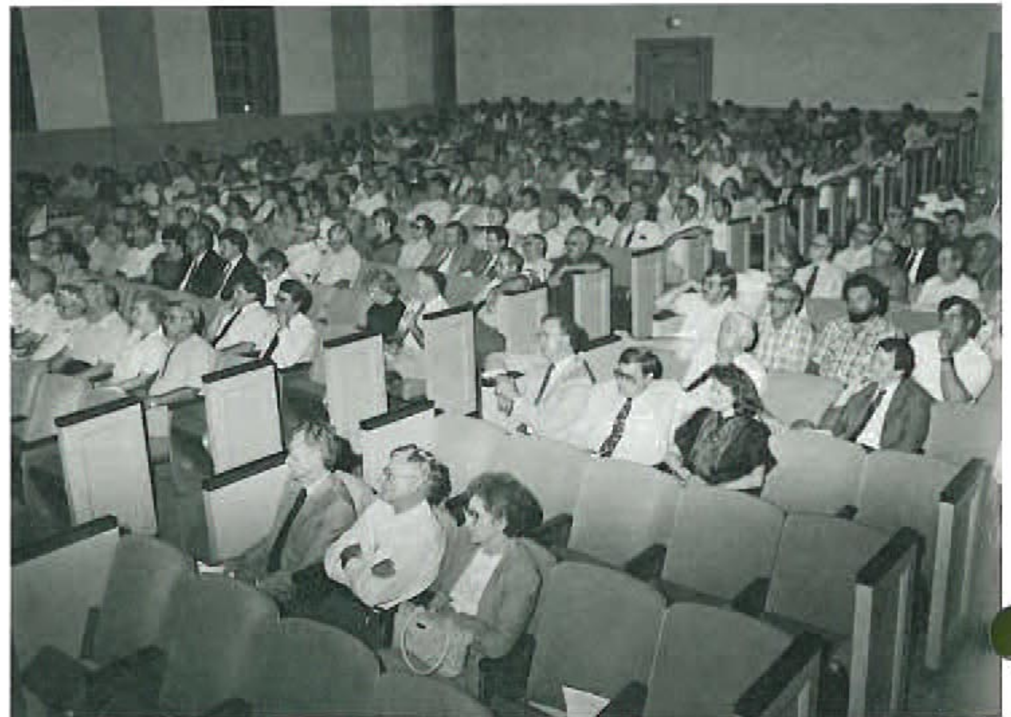
Approximately 325 interested individuals attended the public forum held in Batesville.

ture] are supportive of the roads - you don't need to make believers out of us. We know that they will bring about economic development, they will create jobs, they will create money for the people of this state. But we still have to find the sources of funding, and that's what you [the public] have to tell us about," he stated.