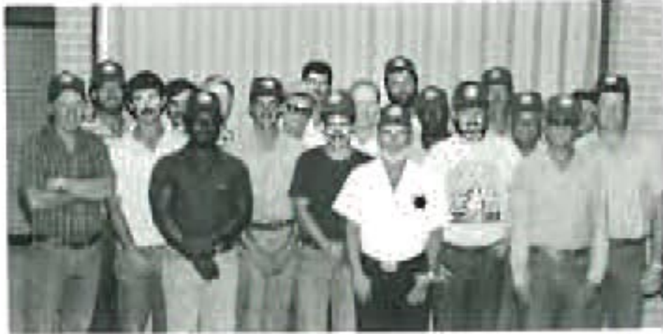
District 8 Service Awards "290 years of service"