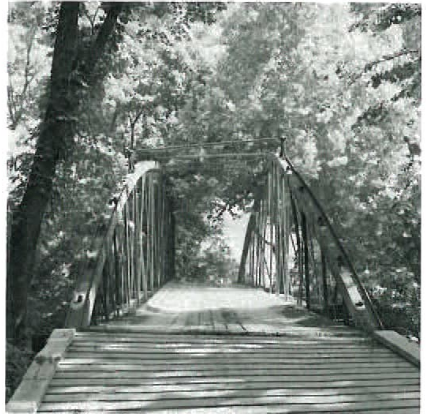
The Springfield Bridge crossing Cadron Creek between Faulkner and Conway Counties is the oldest steel bridge still in use in the state. It is located on Faulkner County Road 222 and, according to data on file at the Faulkner County Courthouse, was constructed in 1871.

Since its completion, not only has the bridge been added to the National Register of Historic Places, but in 1986 it was designated as a National Historic Civil Engineering Landmark by the American Society of Civil Engineers. Most importantly, the old bridge has served the needs of the region effectively for 58 years.