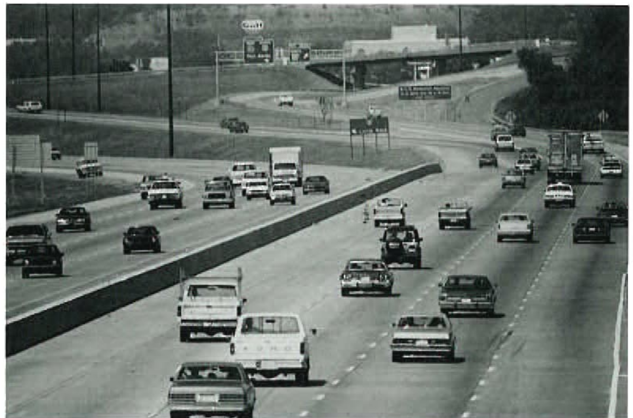
This view looking west from the Lakewood Overpass shows the new look for I-40 in the Dark Hollow area of North Little Rock.

Total cost for the construction, which included the remodeling of three bridges, was approximately $8.5 million.