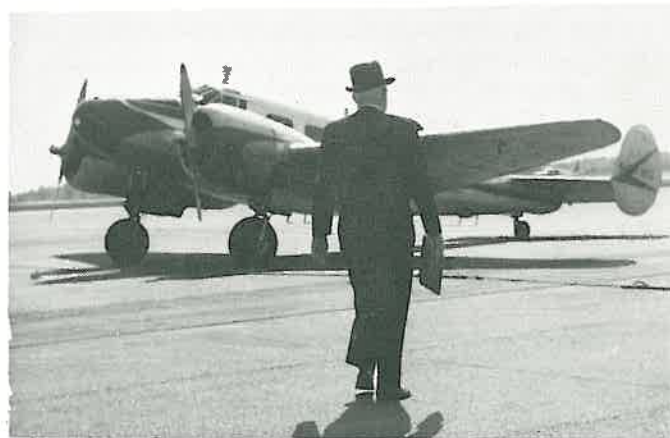
Mr. Oliver approaches the plane ready for take-off.

The pictures here show the new plane and the two men in the Department who will be available to pilot the plane when necessary.