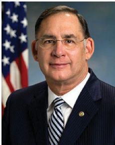
Senator John Boozman (R)

555 Dirksen Senate Office Building Washington, DC 20510 Phone: (202) 224-4843 www.boozman.senate.gov Began: 2011 Re-election: November 2022