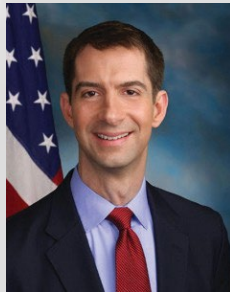
Senator Tom Cotton (R)