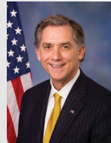
Representative French Hill (R, 2nd District)