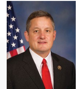
Representative Bruce Westerman (R, 4th District)