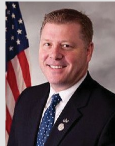
Representative Rick Crawford (R, 1st District)