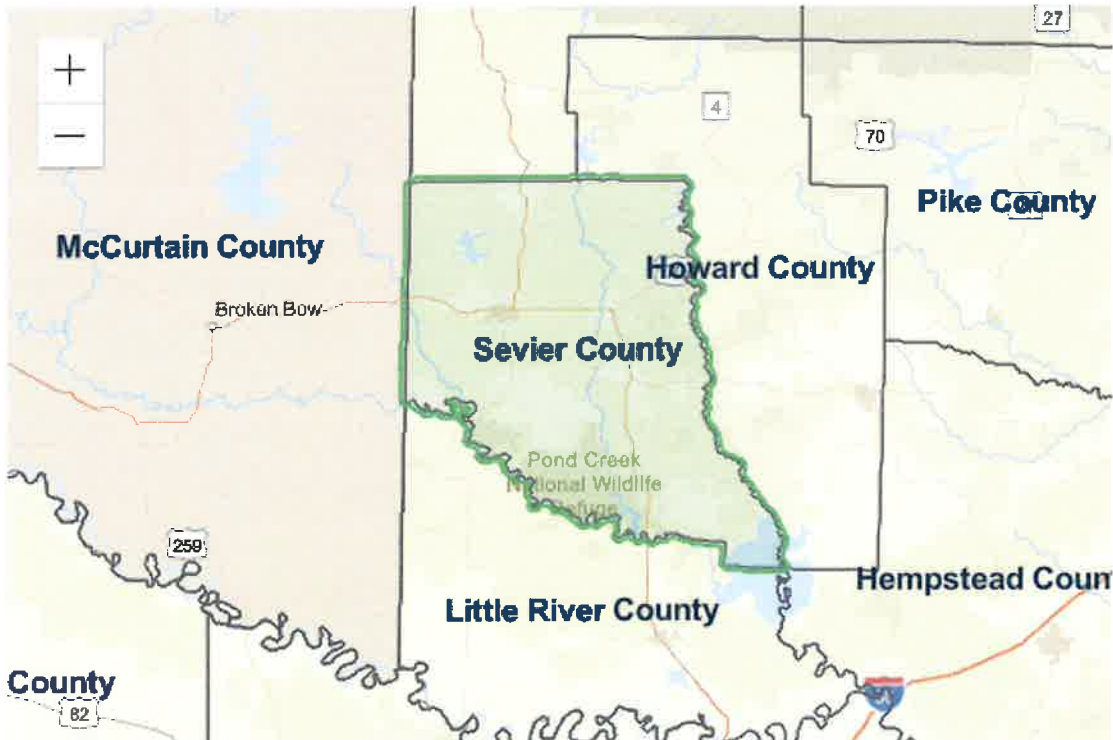
Arkansas GIS Office, Texas Parks & Wildlife, Esri, HER... Powered by Esri