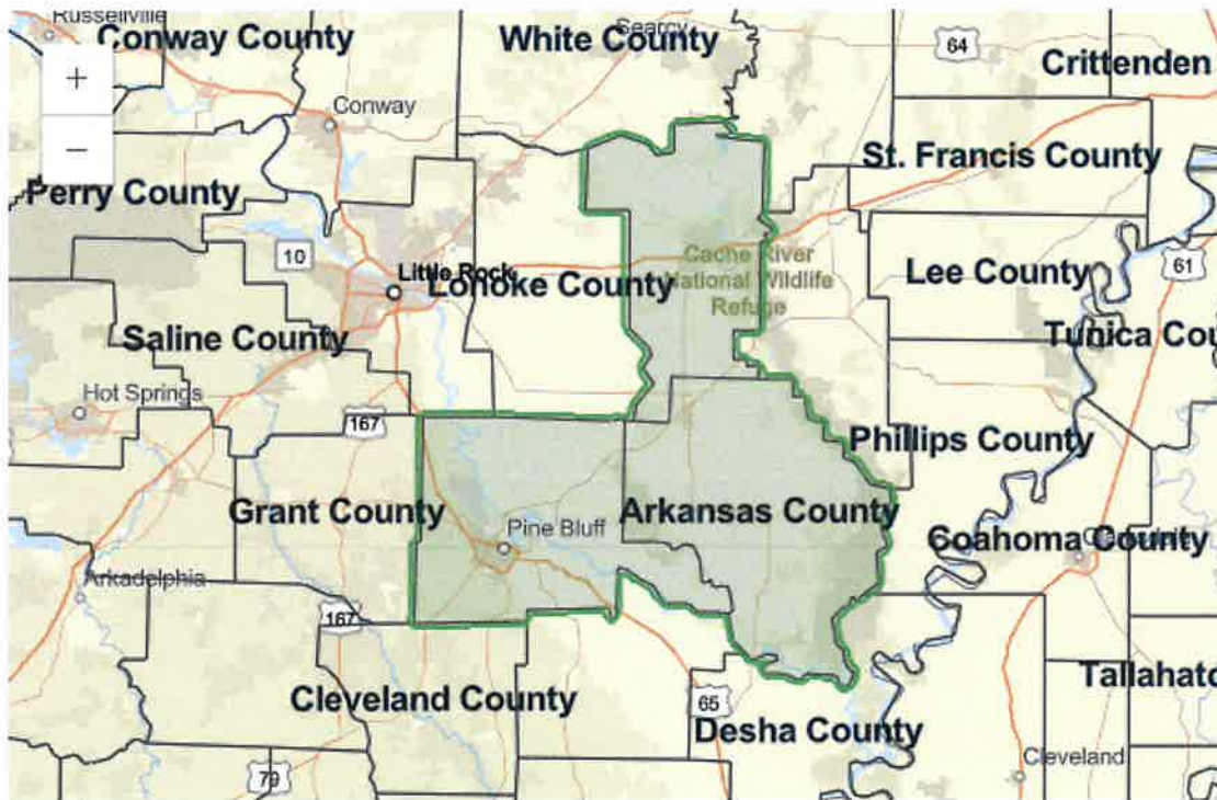
Esri, TomTom, Garmin, FAO, NOAA, USGS, EPA, NPS, USFWS | Esri; U.S. Department of Commer... Powered by Esri