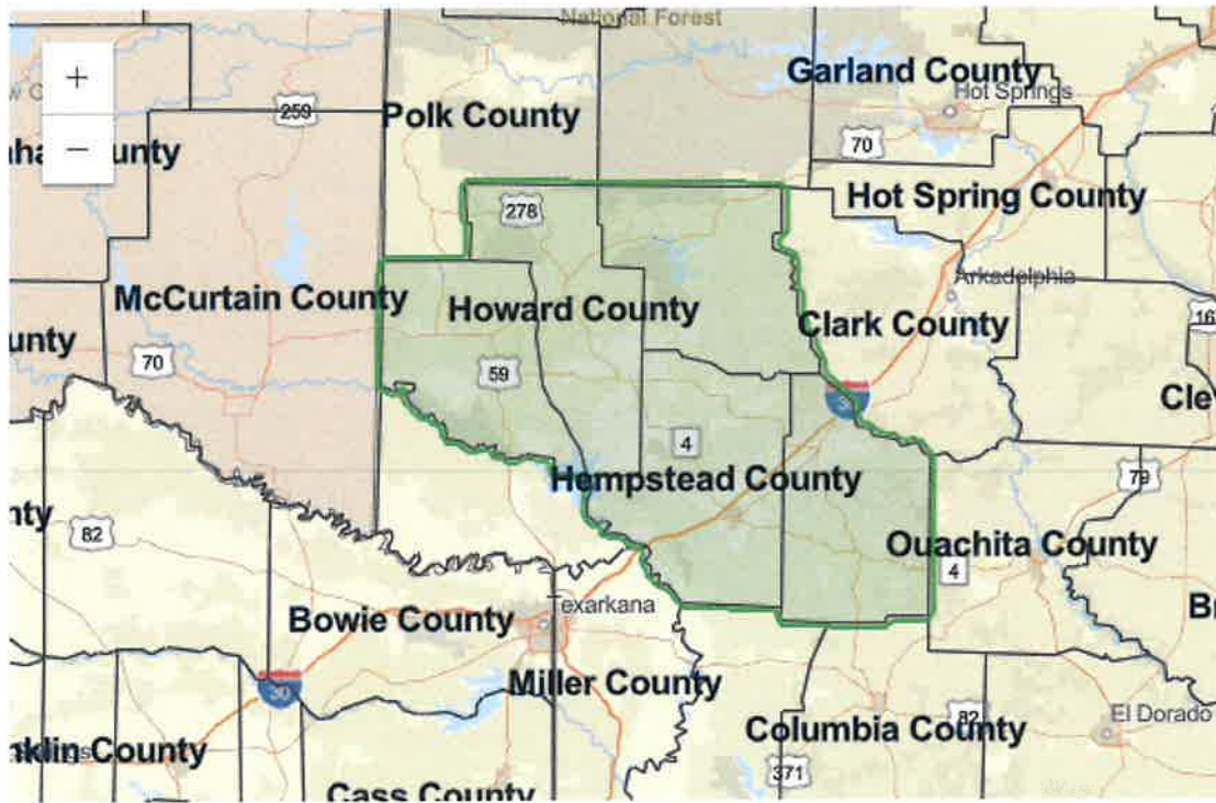
Texas Parks & Wildlife, Esri, TomTom, Garmin, FAO, NOAA, USGS, EPA, NPS, USFWS | Esri; U.S. ... Powered by Esri