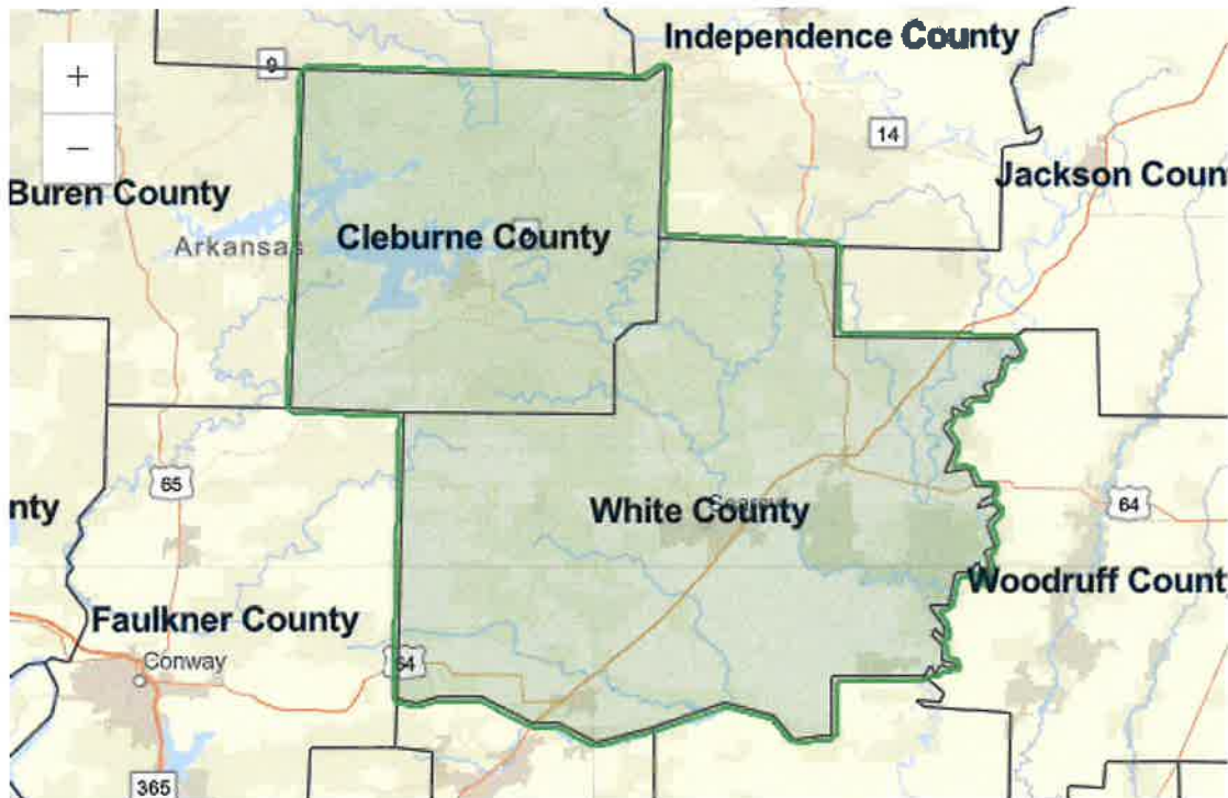
Arkansas GIS Office, Esri, TomTom, Garmin, SafeGraph, FAO, METI/NASA, USGS, EPA, NPS, USF... Powered by Esri