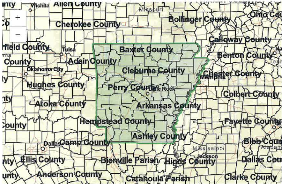
County of Pulaski, AR, Esri, TomTom, Garmin, FAO, NOAA, USGS, EPA, USFWS | Esri; U.S. Depart... Powered by Esri