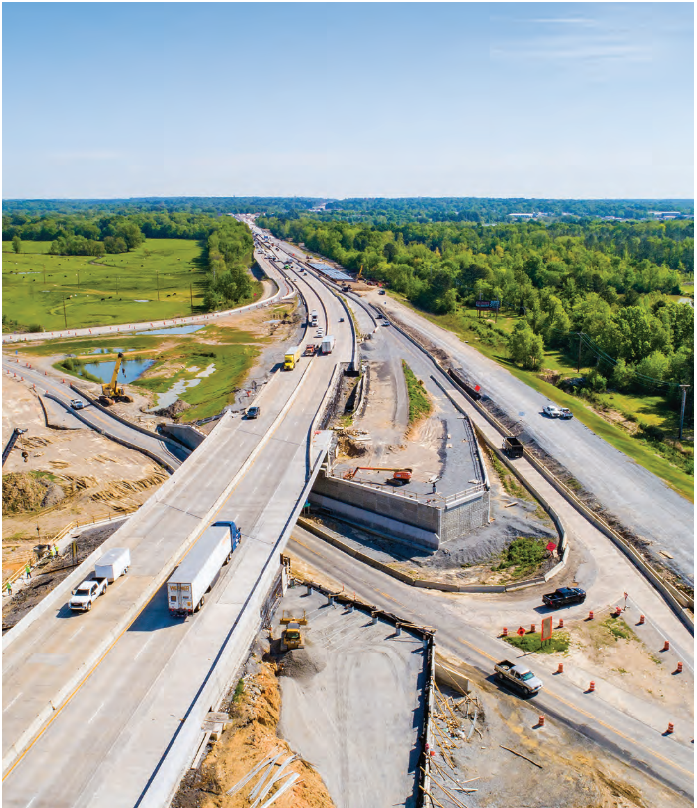
ARKANSAS DEPARTMENT OF TRANSPORTATION | JUNE 2023