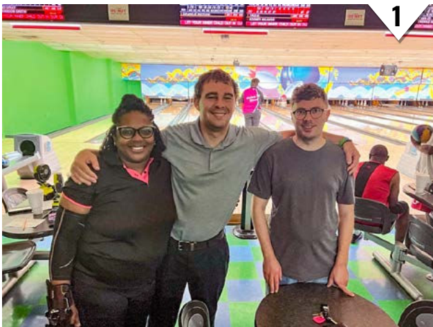
1. BRIDGE: "Team Sparkle Motion" participated in 12 weeks of bowling. The team went from #15 the first week to starting the last week of the Wednesday Night Trio Bowling League at #4. They won all three games in a row which likely placed them at the #3 spot.